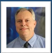
Mayor W. Hildebrand